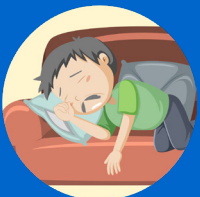
Fatigue and Weakness