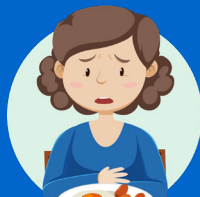
Loss of Appetite