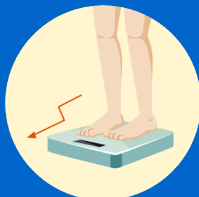
Weight Loss (Unintentional)