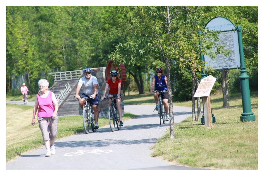
The 2017 Auditor General's report called for a provincial strategy to reduce and prevent chronic disease.

We do not believe a one-size-fits-all approach to board governance is necessary, or even recommended, for the maximization of local public health benefits. For example, on the topic of the built environment, which is a powerful determinant of illness and health, some of the most ground-breaking work in Ontario has been done by health departments that are integrated into regional councils. We see the variability in governance models as a strength that can benefit us all. As long as provincial requirements for governance are clearly articulated and diligently met, the sector can be stronger.