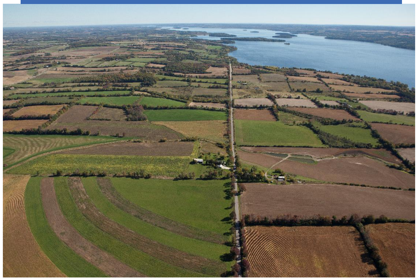
Aerial view of Rice Lake and the surrounding area.