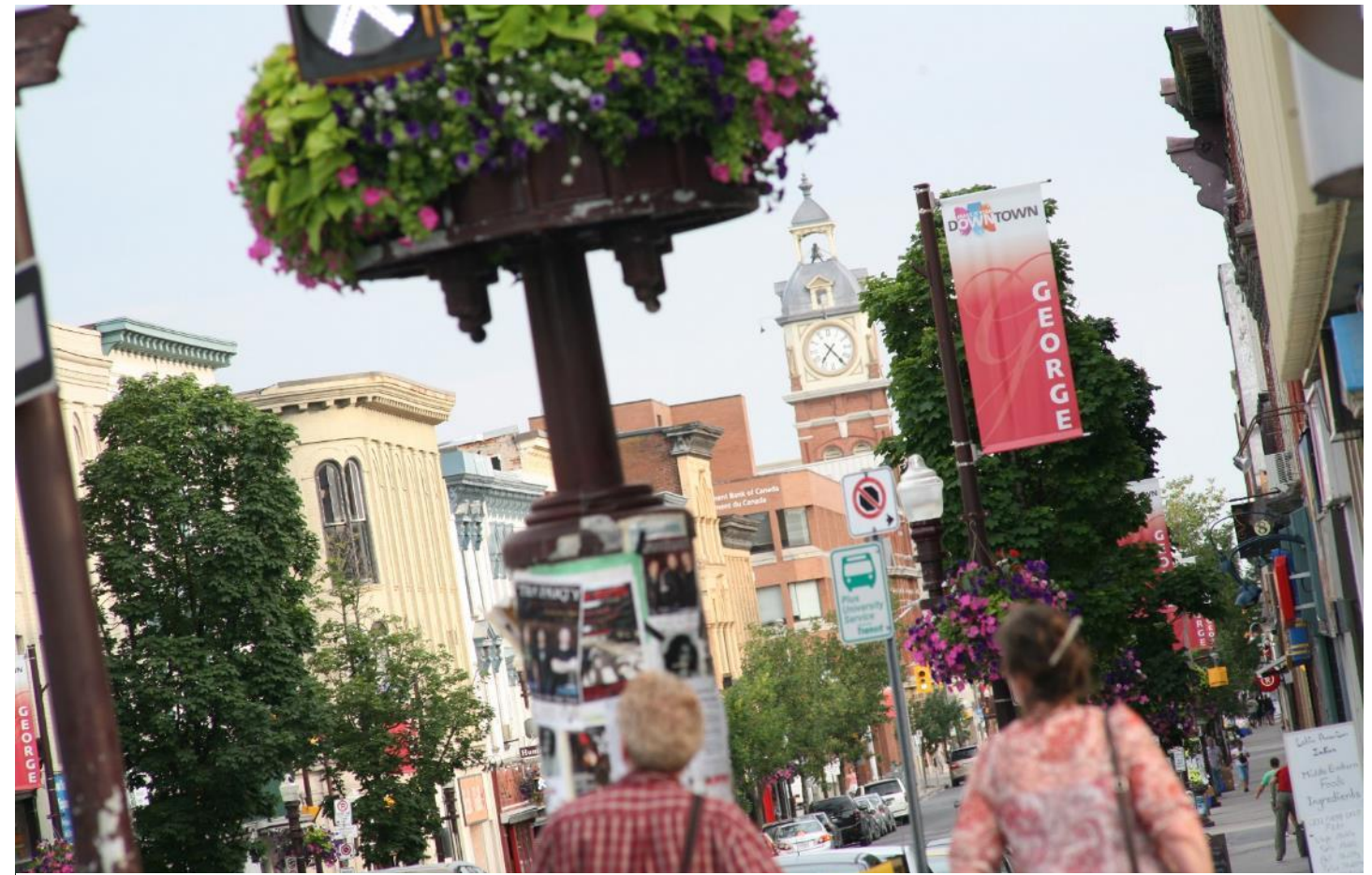
Peterborough Public Health has a proud 130-year history of improving the health of our communities.

Acknowledging the key challenges raised through the discussion document on Public Health Modernization and this opportunity to improve the impact on the wellbeing of Ontarians through strategic changes to the formal public health system and delivery models, and with consideration of the principles listed above, we respectfully submit the following key recommendations in three key areas.