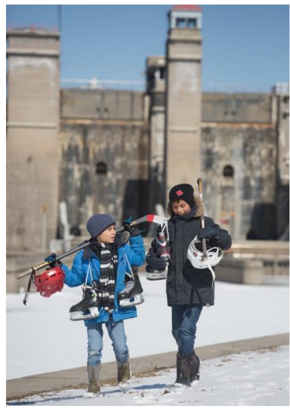
PPH supports establishing provincial goals and targets for chronic disease and injury prevention.

The modernized OPHS is currently implemented through provincial approval of the Annual Service Plan (ASP) for each LPHA. The ASP established accountability to ensure that local planning is based on local needs and resources are allocated