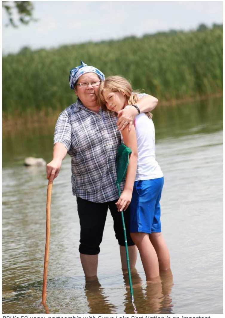
PPH's 50-year+ partnership with Curve Lake First Nation is an important asset moving forward in modernizing public health.

The resulting system of local public health agencies, regional groupings and strengthened provincial coordination and support systems will require adequate resources to achieve expected outcomes. At the local level, a cost-shared model for public health continues to be accepted as the most appropriate model. There must be recognition, however, of the limited capacity the varied obligated municipalities have to fund beyond existing levels. This varied ability to pay has historically and could continue to create a disparity in service levels across the province. A funding formula needs to be created that will ensure a sustainable delivery of public health service without undue pressure on obligated municipalities.