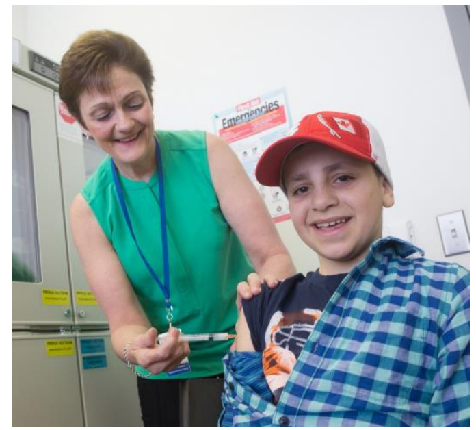
Peterborough Public Health provides catch up vaccinations for new Canadians, including this boy originally from Syria.

Ontario experienced a prolonged drought for public health that was brought to light with the tragedies of both SARS and Walkerton. We hope that important lessons have been learned and that the neglect that occurred in the past will not be repeated. In order to do that, boards of health need to know that the Province is committed to investing in public health in order to protect its citizens and keep our communities open for business.