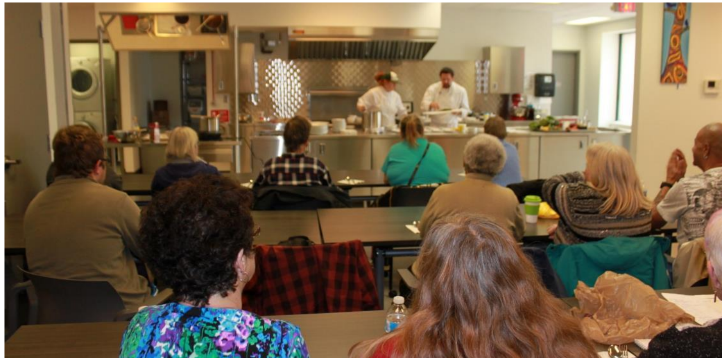
Teaching food skills in PPH's Community Kitchen supports better nutrition for families, preventing hallway health care.

To deliver high quality programs, staff at each LPHA must have the appropriate competencies. Organizational leaders (including governors), frontline and back office staff must have core public health competencies and specialized knowledge and skills to meet the provincial standards and requirements. Standards for staffing of