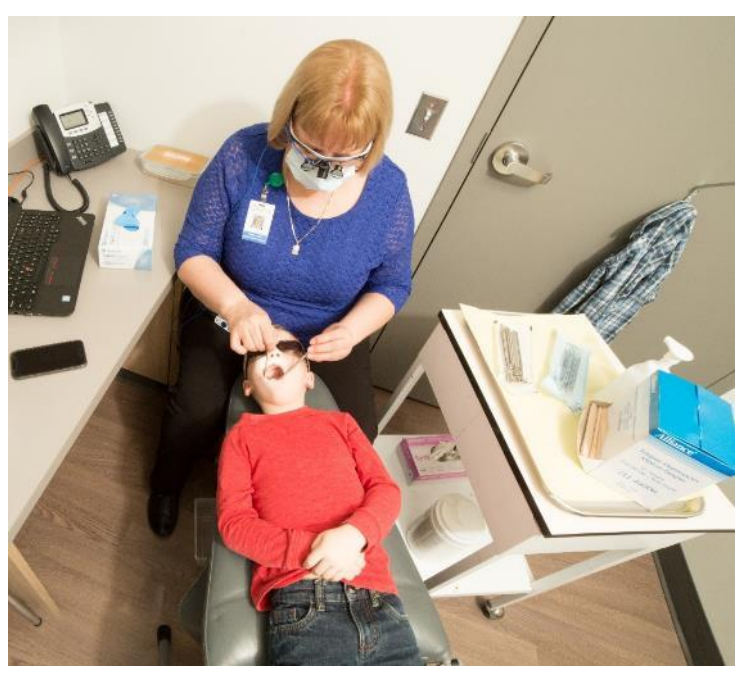
Healthy Smiles Ontario provides dental care to low-income children. It used to be 100% funded by the Province, and is now part of the 70-30 provincial-municipal cost-shared budget.

Provincial priority setting will enhance alignment and focus at all levels of implementation. This should not, however, supersede the Ontario Public Health Standards and expectations for local flexibility. The Annual Service Plan process should be used to set expectations for provincial priorities and ensure a minimum level of service across all areas of the public health mandate.