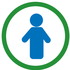
Tested swimmers permitted to enter alone