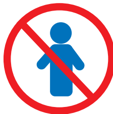
Children under 6 admitted only with parent/guardian