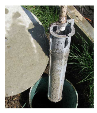
Clogged effluent filters can lead to sewage back ups.

Properly functioning onsite sewage systems can increase the value of your home, prevent costly repairs, stop raw effluent and excessive nutrients from leaching into our waterways and help prevent contamination of aquifers your source of drinking water!