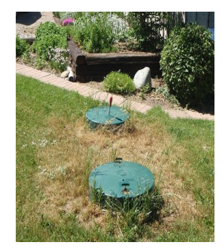
Landscape so that the risers are easily found and accessible.