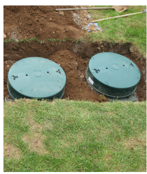
Tank risers ensure safety and accessibility for servicing.